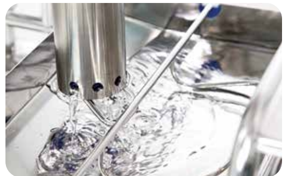
Depressing lever with mop releases the exact amount of liquid