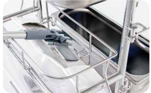
Remove with pressure—dirty mops fall into a waste bag