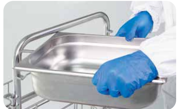
Quickly remove and store if not needed