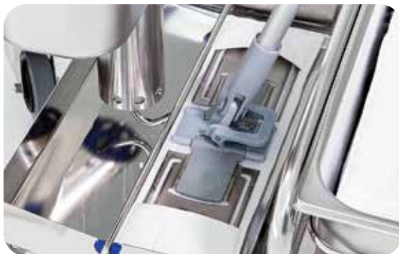
Precisely dose one mop at a time in a matter of seconds