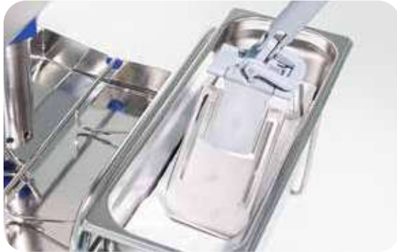
Insert a Saturix Mop Frame into a Saturix Microfiber Mop