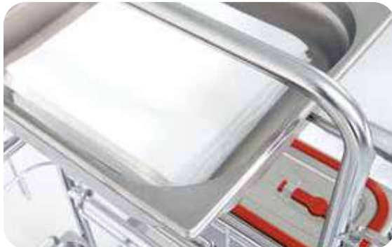
Convenient storage of easy-to-access wipes